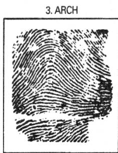
ARCHES HAVE NO DELTAS